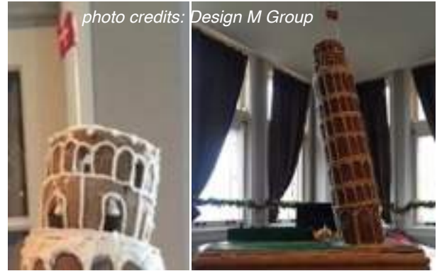
top of bell tower with bells and flag.

So, we decided to build a structure smaller and less complicated this year (or though we thought), the