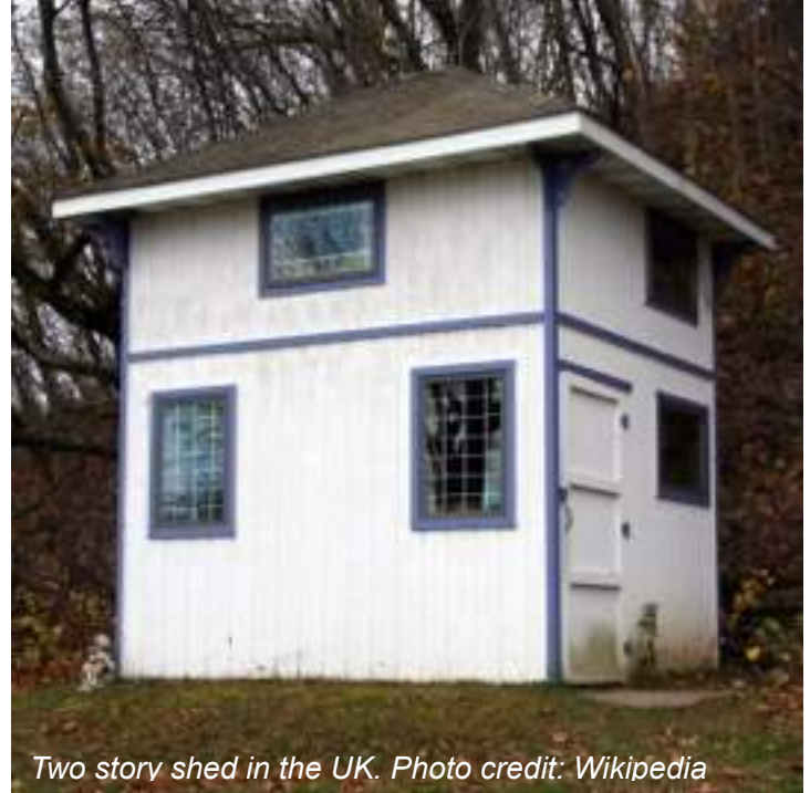
Two story shed in the UK.

ShedBlog.Co.Uk. The competition showcases many labors of love. So, if you’re seeking an oasis, consider creating your own. Your ideal workspace doesn’t have to be big. Sometimes all you need is some privacy.