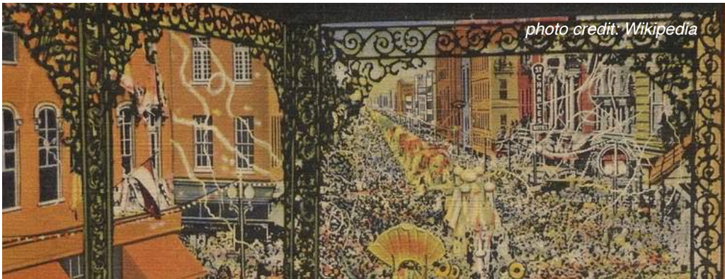
Photo Caption: Rex Greets His Subjects, Mardi Gras, New Orleans. A circa 1920s -40s postcard of the view looking up St. Charles from a balcony on the former Kolb's Restaurant (125 St.Charles) with crowds in the street and floats of the Rex parade receding into the distance.

How strange that the definitions of "balcony" make no mention of its primary trait, perspective. Consider "Romeo and Juliet," Buckingham Palace, and the balconies of Lima. Balconies allow us to see others better. Crowds of thousands, even tens of thousands, can see those on a balcony. Balconies afford the ones standing on them a different, presumably better view than that of everyone else, whether of a theater stage, a courtyard, or the ocean. Such views are desirable and often priced at a premium, so balconies also seem difficult to attain. They are for the few and not for the many, we think.