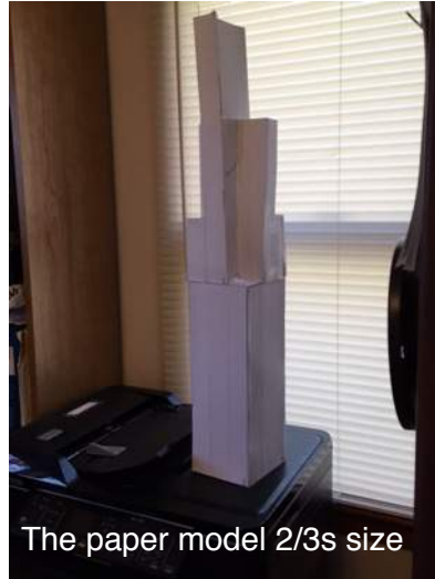
The paper model 2/3s size

Much planning goes into this type of project, first the drawings then a model before the baking.